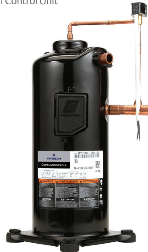
Copeland™ ZPD54K5E-PFV-130 digital scroll compressor